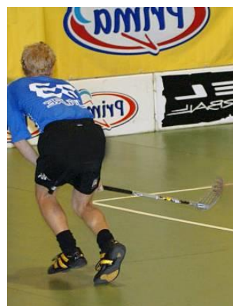
Using a left stick