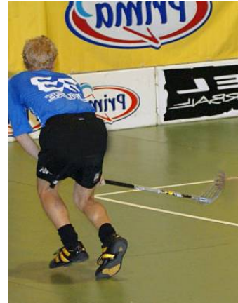
Using a left stick